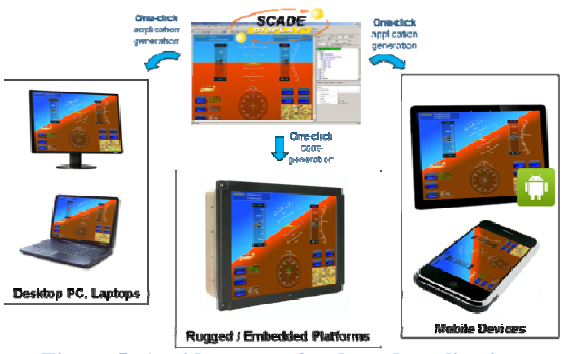
Figure 5: A wide range of code and application generation targets

The SCADE model-based tool suite also features the automatic, one-click, generation of the HMI executable application for a variety of targets. As a matter of fact, the code generated out of SCADE is fundamentally independent from the target platform - whether it is the hardware and associated drivers, or the operating system - as no system calls are being performed in this generated code. The portability of HMI models as executable applications is thus greatly facilitated, as the only needs for adaptation often only reside in the main execution and interaction loops, or in the windowing system management, even though the always wider adoption of international standards like OpenGL – for the drawings – or EGL – as the associated windowing system - also facilitates this task.