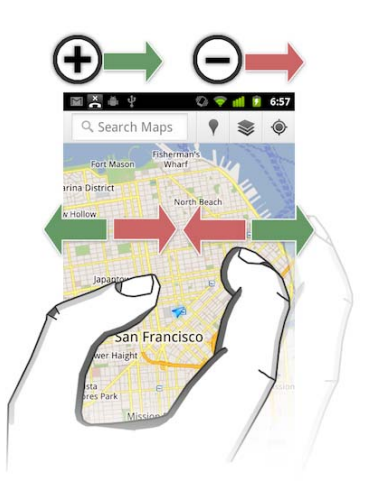
Figure 4: Map zooming function with two fingers

As an example, with SCADE, in order to implement a now "classical" map zooming function with two fingers on a tactile screen, two pointer event listeners (one per finger) and one behavior construct for the zooming algorithm will be used. This design pattern can be stored as a SCADE library element – a kind of micro-model – for latter reuse in any another HMI model.